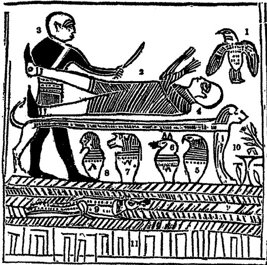
A FAC-SIMILE FROM THE BOOK OF ABRAHAM. NO. 1.