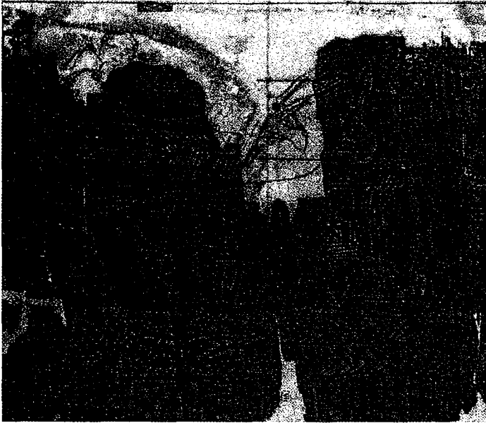
Fig. 2: Vignette of P. JS I, as restored during the lifetime of Joseph Smith.

his erect phallus 23 in preparation for landing on it in order to conceive Horus. 24 To assist in the assessment of these suggestions, Figure 3 reproduces a drawing of the damaged vignette as it survives today. 25