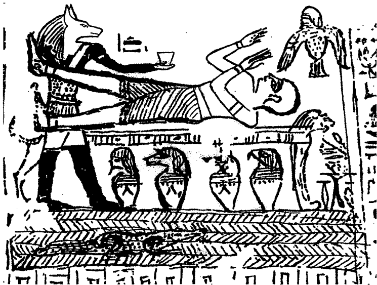
Fig. 4: Suggested reconstruction of the vignette of P. JS I. Drawn by L. Bell over the base reproduced in Fig. 3.

combine anklets, armbands, and bracelets. The deceased may or may not have had a collar around his neck. Because Hor's left arm seems to have crossed his chest, I think the possibility that he wore a "kilt" extending above his waist can safely be eliminated as too complicated for the needs of our provincial artist.